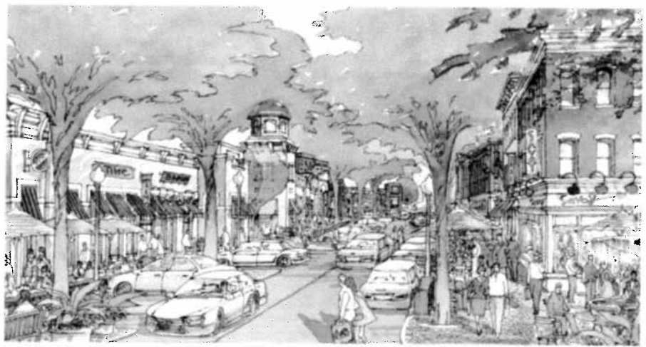
The Glassworks' 'Main Street'-style retail area will include merchants, service shops and restaurants.

"An exciting, productive addition to our community"