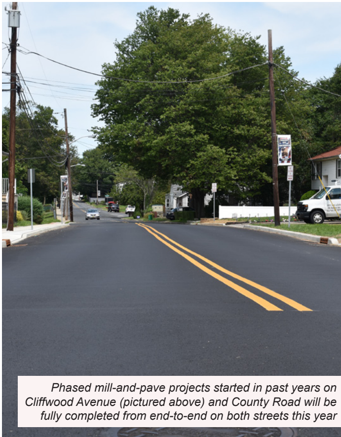
Phased mill-and-pave projects started in past years on Cliffwood Avenue (pictured above) and County Road will be fully completed from end-to-end on both streets this year