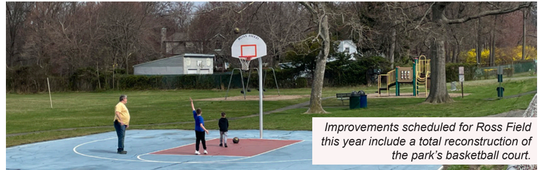
Improvements scheduled for Ross Field this year include a total reconstruction of the park's basketball court.