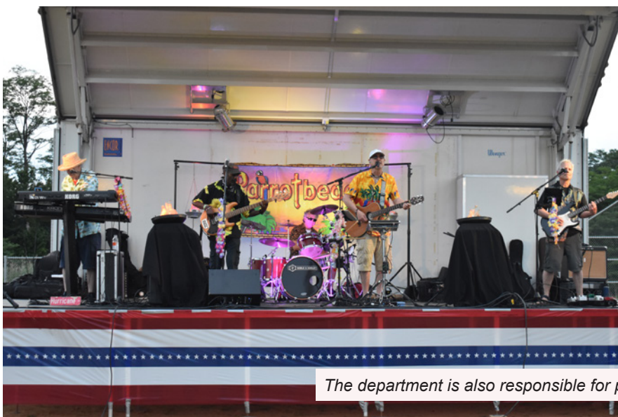
The department is also responsible for planning the popular Summer Concert series, Aberdeen Day and other special events.