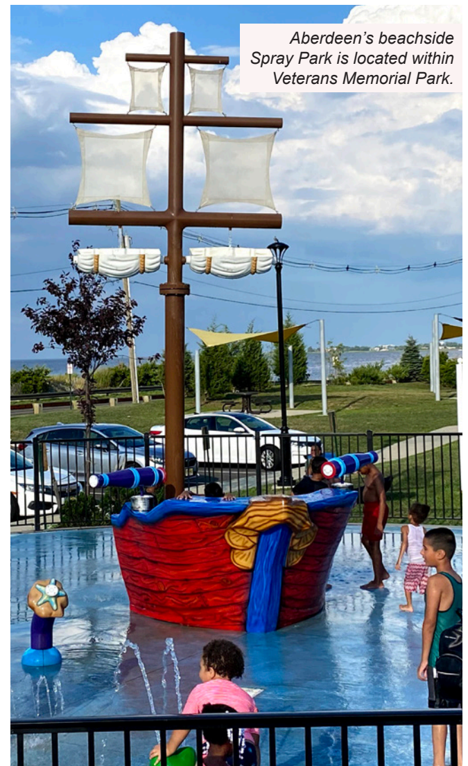
Aberdeen's beachside Spray Park is located within Veterans Memorial Park.