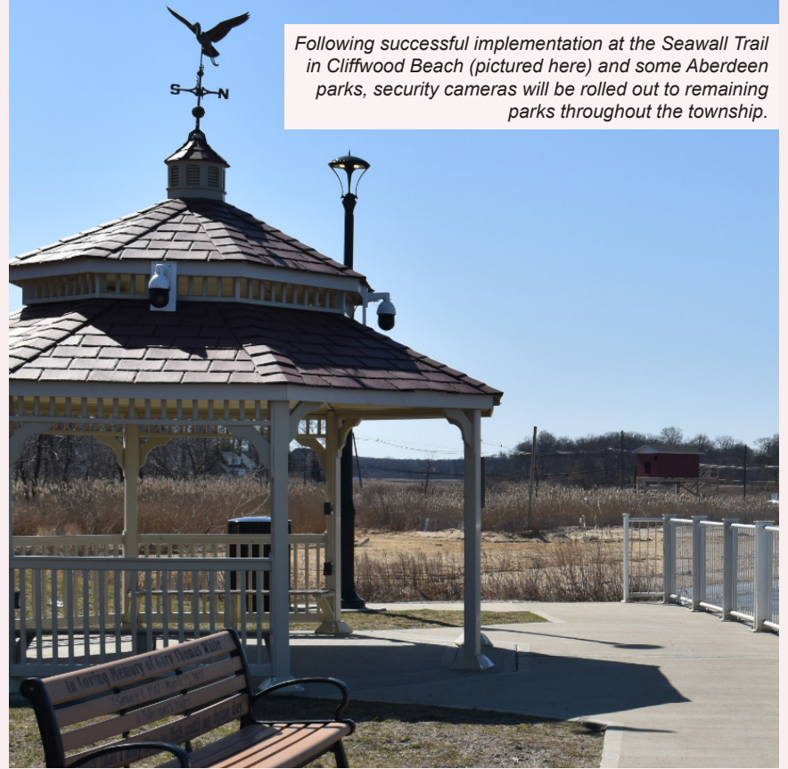
Following successful implementation at the Seawall Trail in Cliffwood Beach (pictured here) and some Aberdeen parks, security cameras will be rolled out to remaining parks throughout the township.