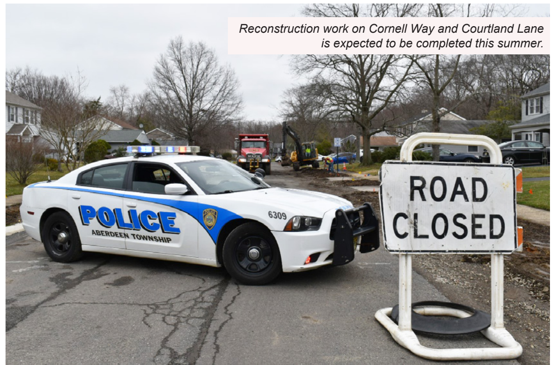
Reconstruction work on Cornell Way and Courtland Lane is expected to be completed this summer.