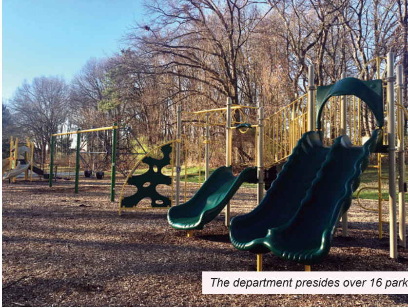
The department presides over 16 parks throughout the township as well as such facilities as the Senior Center at Hudson Ridge.