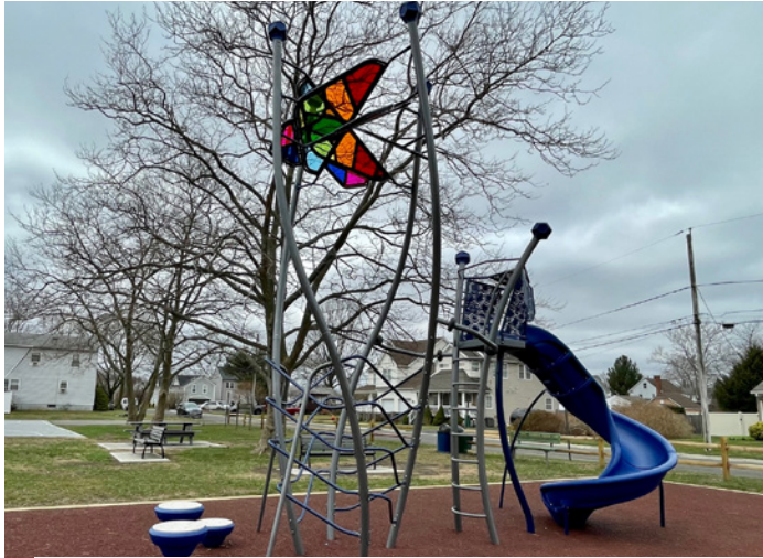
Contemporary playscapes and other amenities installed in playground at Joseph J. Bookett Park (above) and Fordham Park last year are representative of the upgrades Aberdeen has been making to its neighborhood parks.

Continuing the multi-year initiative to revitalize all neighborhood parks throughout town, Aberdeen's Council and Parks & Recreation Department have set their sights on Ross Field, Midland Park and Cambridge Park for this year's round of capital projects.