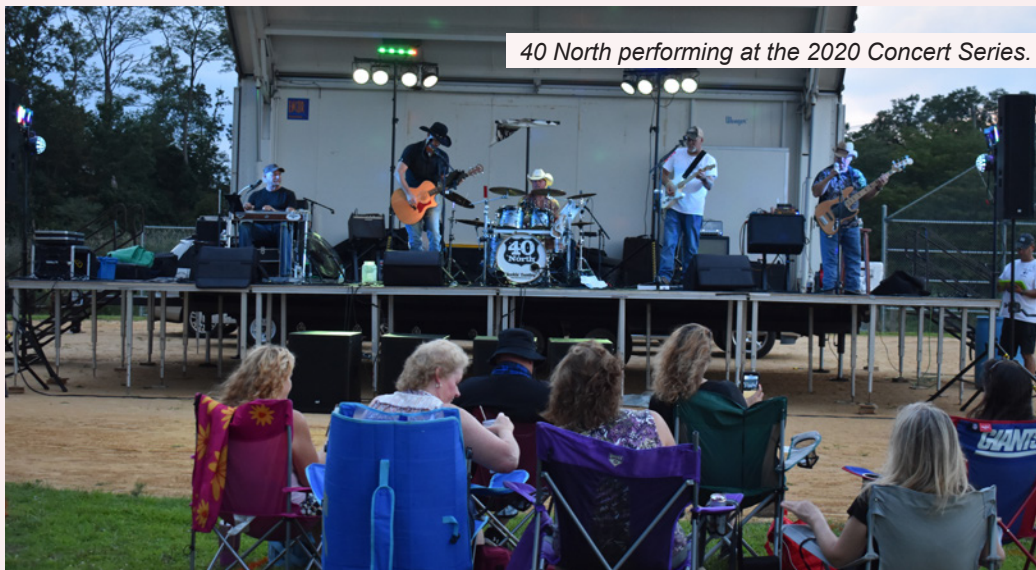
40 North performing at the 2020 Concert Series.

Veterans Memorial Park is located at Ocean Boulevard and Lakeshore Drive in Cliffwood Beach.