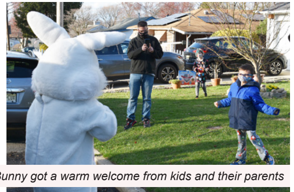
The Easter Bunny got a warm welcome from kids and their parents