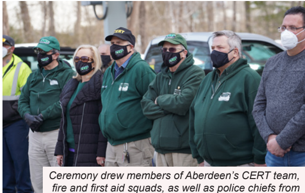
Ceremony drew members of Aberdeen's CERT team, fire and first aid squads, as well as police chiefs from other parts of Monmouth County.